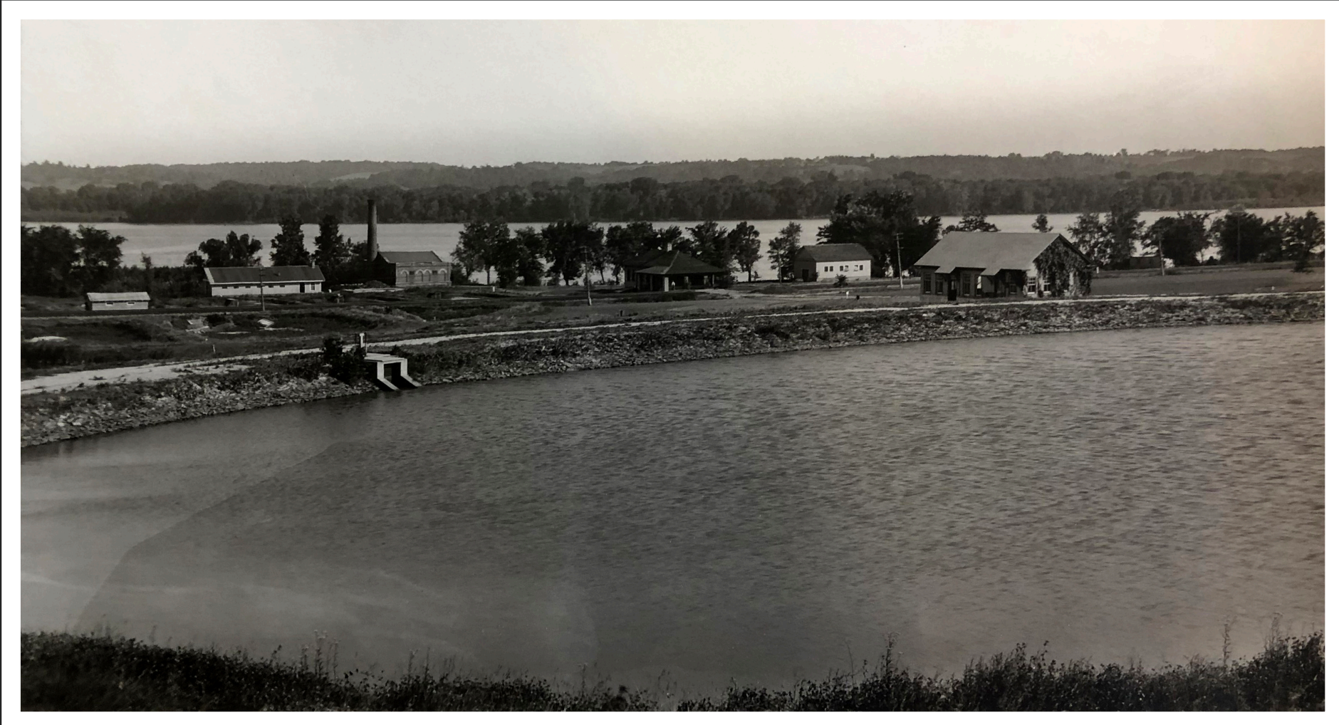
Overview of Main Reservoir in 1920 during dedication ceremony, facing south.

The reservoir supplied water to all the fish ponds, the tank house, the basement of the main lab, and the temporary lab through 6- and 8-inch gravity flow pipes. Although pumping operations were conducted for several hours every day, the capacity of the reservoir allowed for the cessation of pumping operations for two or three days in the case of emergencies. Today, as in the past, river water is pumped directly to the reservoir from the modern pumphouse. The reservoir water is then directed through gravity feed underground piping to all the ponds where fish production activities are conducted. In recent years the Constellation Energy Corporation has used the reservoir to propagate mussels that are introduced into the Mississippi River and its tributaries. It is hoped the program will expand in the future.