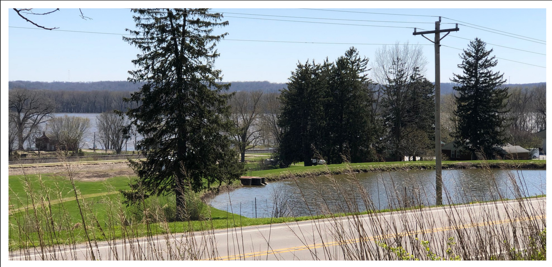
Overview of the Main Reservoir from the entrance to the Living Quarters in 2021, facing southwest.